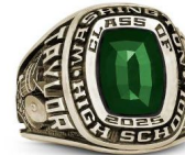
174 Applause Identity Class Ring