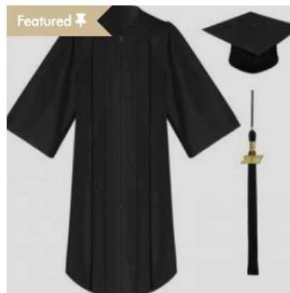
Cap, Gown & Tassel Unit