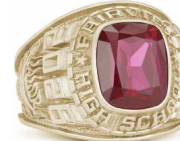
113 Pinnacle Identity Class Ring