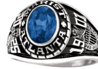
121 Stellar Identity Class Ring From $268.00