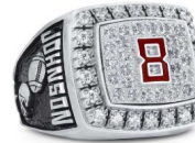
157 Contender Identity