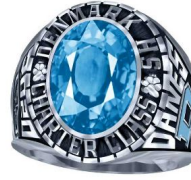
111 Identity Landmark Class Ring From $268.00