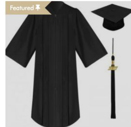
Cap, Gown & Tassel Unit