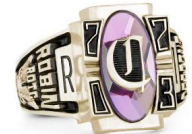
L31 Endeavor Legend Class Ring